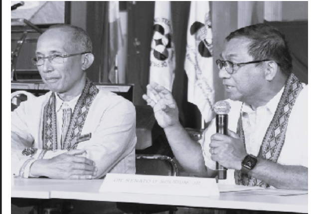
Baguio City Mayor Magalong and DOST Secretary Solidum during the press conference